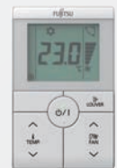
LCD Simple Controller without Operation mode* UTY-RHRYT